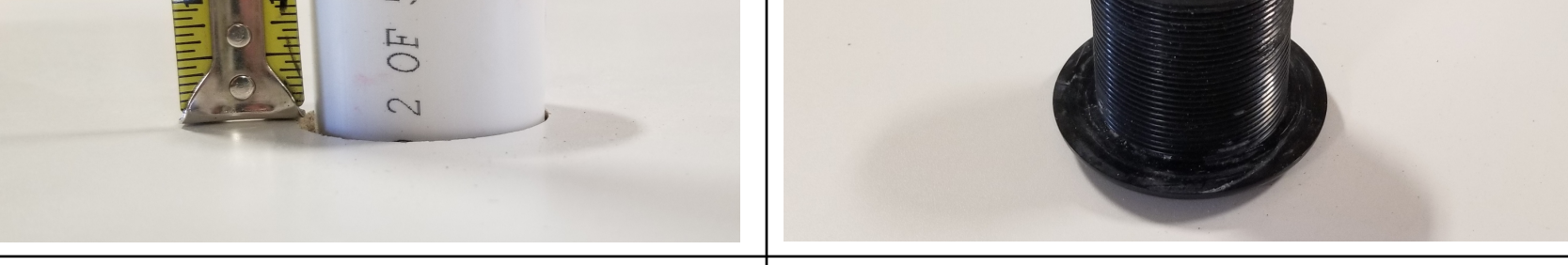
1. Use 1.5" PVC to supply water to the bowl. Cut PVC leaving 1in protruding above the surface where the bowl will be mounted.