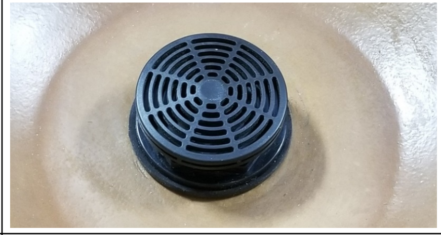
8. Thread in the diffuser to the female threads of the flange. Hand tighten.