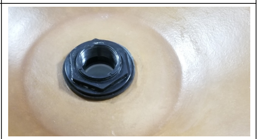
4. First place the foam gasket over the flange. Second place the washer on top of the foam gasket. Third thread the nut to the flange